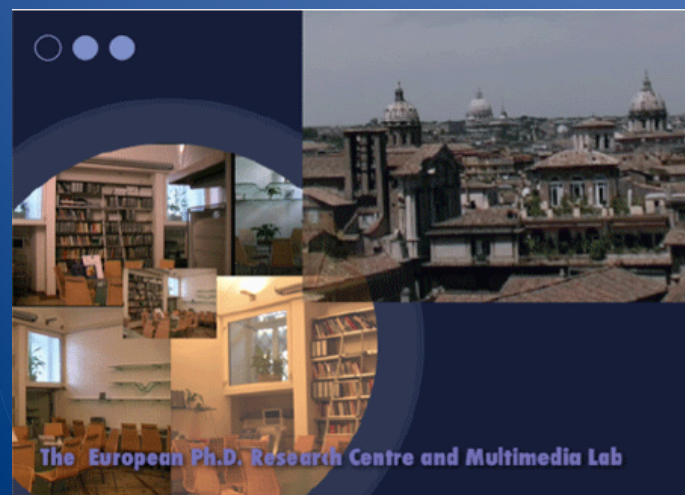
The European Ph.D. Research Centre and Multimedia Lab