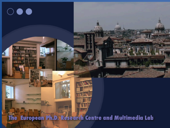
The European Ph.D. Research Centre and Multimedia Lab