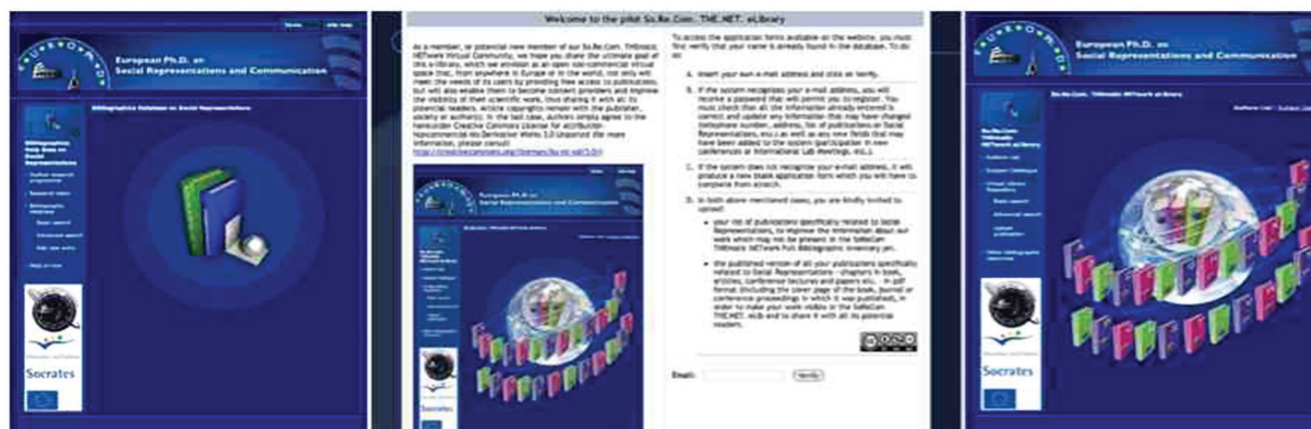
Figure 3. The So.Re.Com. "A.S. de Rosa" bibliographical repositories and @-Library.

This @-library supports access to multiple repositories and web-tools, designed by A.S. de Rosa and implemented on the EuroPhD website, in order to integrate the three main pillars (Figures 3, 4, and 5).