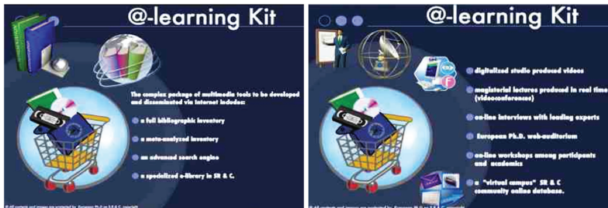
Figure 5. Distance tutoring and co-tutoring tools based on personalised access to research reports and on-line evaluation of trainees' research reports