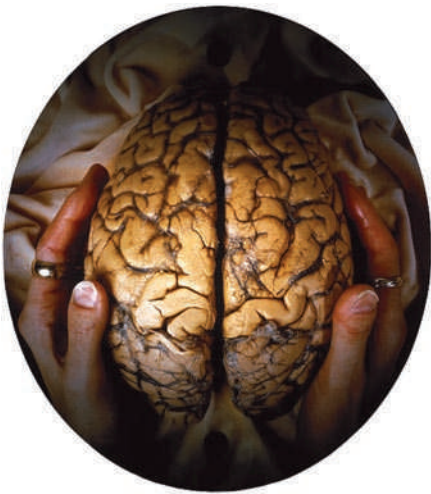
Figure 1 | Helen Chadwick (1991) Self-portrait.

of non-coding regions and other possibilities for gene modifications bring complexity to the genome. In addition, increasing evidence shows that genes undergo structural epigenetic changes that mark genomes with a distinctive history of their own. The different brain structures and functions equip this organ with a complexity that is not reducible to simple combinatorial rules. Second, the brain provides a dynamic material edifice for the repository of human identity due to its inherent singularity and uniqueness. The incessantly changing structure and synaptic organization of the brain is the result of a continuous interplay of external contingent socio-environmental stimuli (that may drive epigenetic events) and internal processes that result in unique neuronal networks 23 . However, even if a neuroscientific understanding of the self is currently prevailing in the public domain, it is not exclusive as neuroscience encompasses genetics, cell and molecular biology, psychiatry and cognitive and behavioural studies.