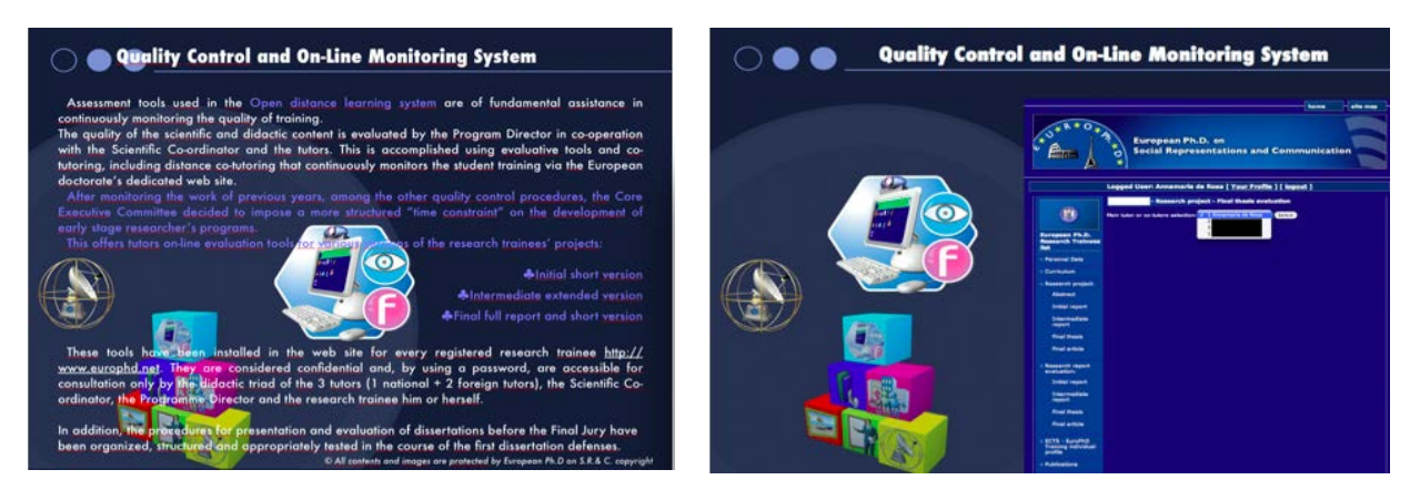
Fig. 2. Distance tutoring and co-tutoring tools based on personalised access to European/International Joint PhD in S.R. & C. research reports nd on-line evaluation of trainees' research reports at the initial, intermediate and final stages